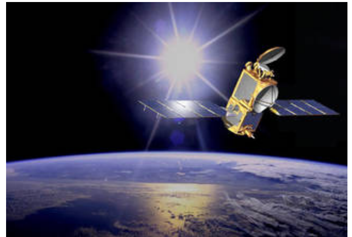
The Jason-2 satellite orbits Earth. It carries tools and sensors to help scientists study the oceans.

Many NASA satellites carry cameras and scientific sensors. Sometimes these instruments point toward Earth to gather information about its land, air and water. Other times they face toward space to collect data from the solar system and universe.