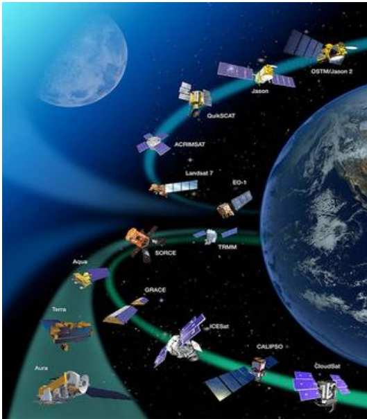
NASA has more than a dozen Earth science satellites in orbit. They help NASA study the oceans, land and atmosphere.

A satellite is a moon, planet or machine that orbits a planet or star. For example, Earth is a satellite because it orbits the sun. Likewise, the moon is a satellite because it orbits Earth. Usually, the word "satellite" refers to a machine that is launched into space and moves around Earth or another body in space.